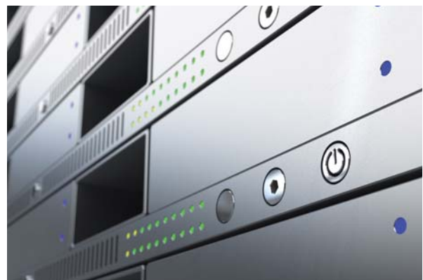
Leverage technology to reduce risk and improve performance