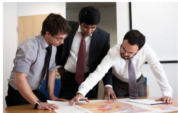
Make the best decisions with all available data and insight

FDS has more than 350 personnel dedicated to serving the oil and gas industry, backed by over 15,000 employees worldwide.